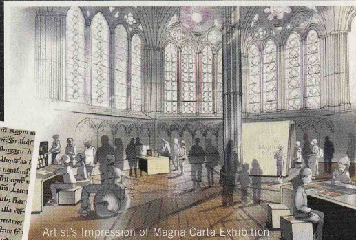
Artist's Impression of Magna Carta Exhibition