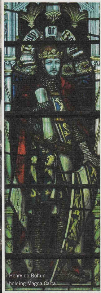
Henry de Bohun holding Magna Carta